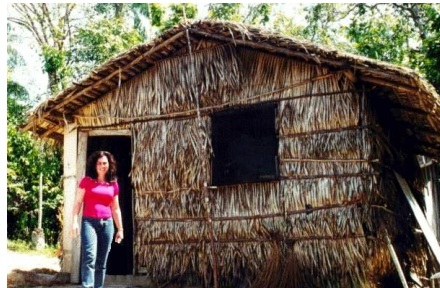
Brazilian jungle hut