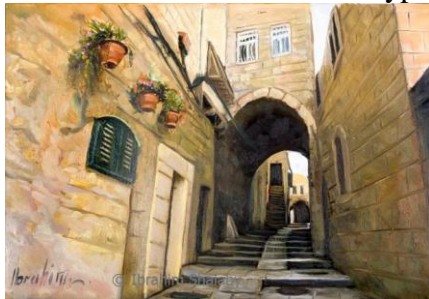
Palestinian vernacular house